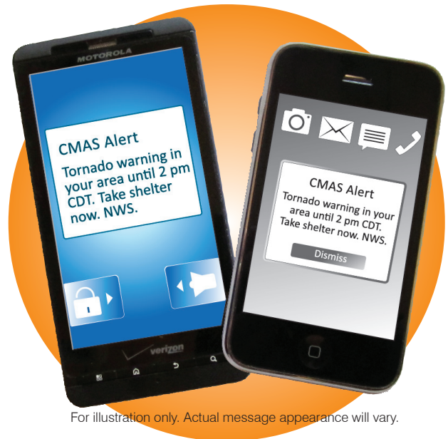
For illustration only. Actual message appearance will vary.

The alerts will tell you the type of warning, the affected area, and the duration. You'll need to turn to other sources, such as television or your NOAA All-Hazards radio, to get more detailed information about what is happening and what actions you should take.