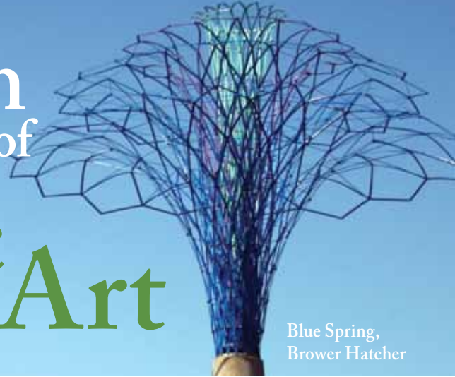
Blue Spring, Brower Hatcher