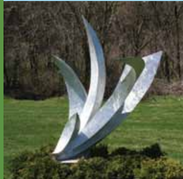
Restless Recovery, Beth Nybeck