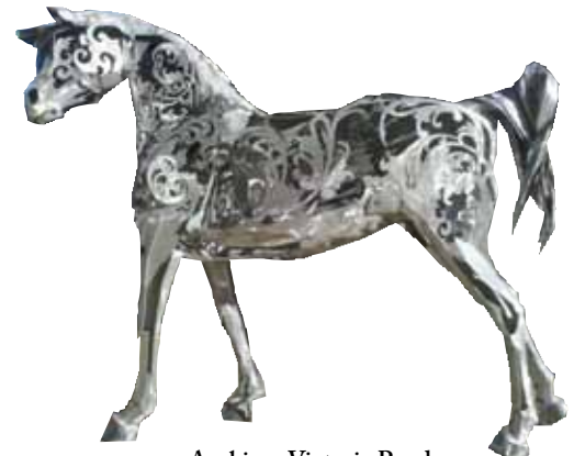
Arabian, Victoria Reed

"Inspired Visions" temporary art exhibit will be on display from April to October 2011.