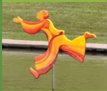
Sundance, Cecilia Luenza

The Blue Springs Public Art Commission was created by City ordinance in September 2000 to develop a public art program that would enhance the aesthetic appearance of the community and make Blue Springs an even more desirable place to live, work and locate a business.